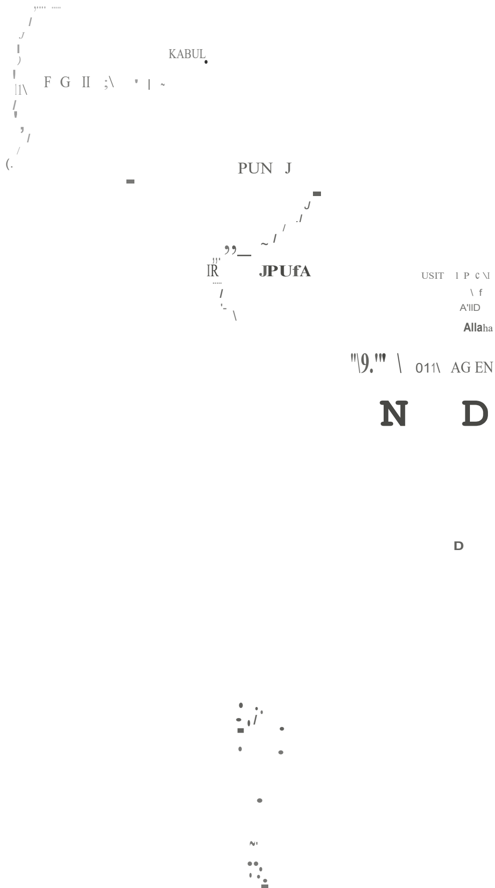
MAP 4: British India and the princely states, c. 1904